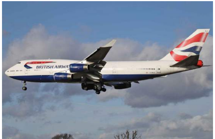
Cutting aviation emissions to zero may not be possible, so 'negative emissions' are needed.