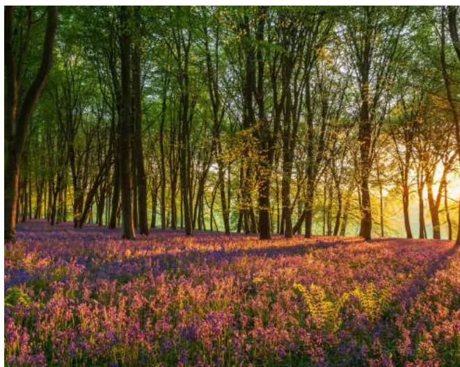
Mixed forest absorbs more carbon dioxide than monoculture forests.

Natural solutions are likely to be cheaper than BECCS, which is estimated to cost $100-400 per tonne of carbon sequestered. For comparison, the EU carbon price stood at €5-10 per tonne for most of its existence, although it has latterly risen sharply to €25. Currently there are no economic mechanisms designed to pay for negative emissions.